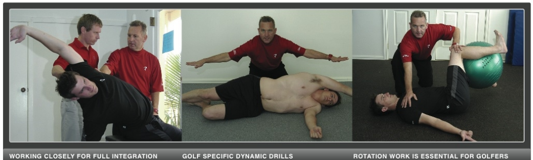
WORKING CLOSELY FOR FULL INTEGRATION