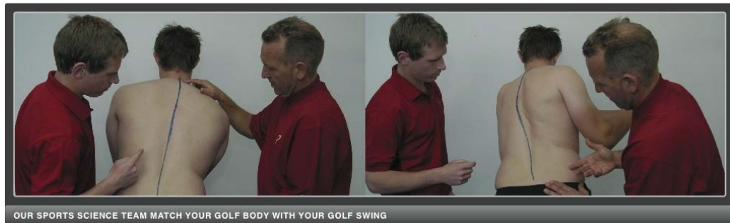
OUR SPORTS SCIENCE TEAM MATCH YOUR GOLF BODY WITH YOUR GOLF SWING

A full analysis and report from your PGA golf coach is strongly recommended. Please note, your golf coach is welcome to attend the three days and have full involvement in the program.